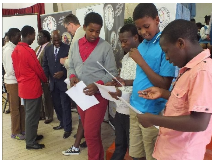
President's Award Ceremony in Keiskammahoek