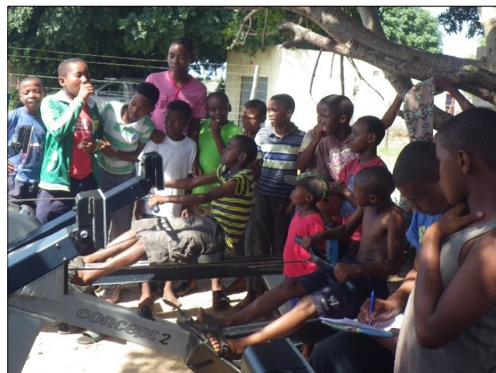
kids pulling ergo at our Open Day

To run our programme, we need your support. Did you know that you can make a safe and easy credit card donation on the internet? Go to our website www.matinyanafund.org.za and click the donate button, or click here .